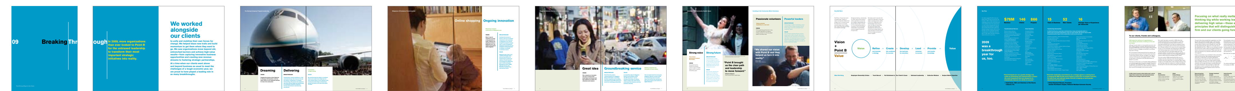
Corporate Identity, Benefits Brochure