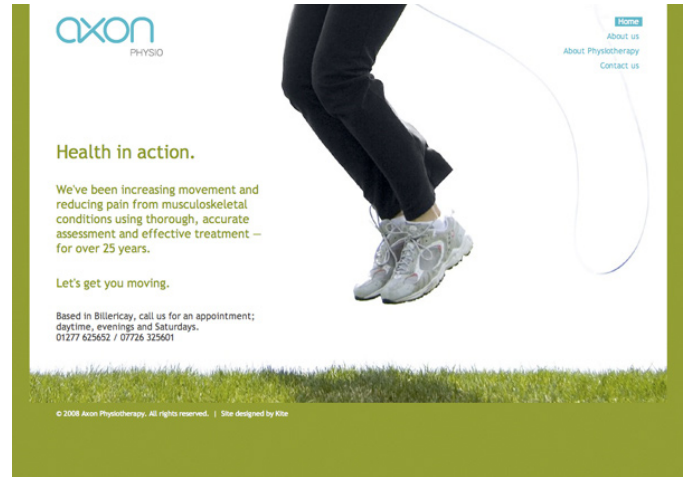
Web Site (Home)