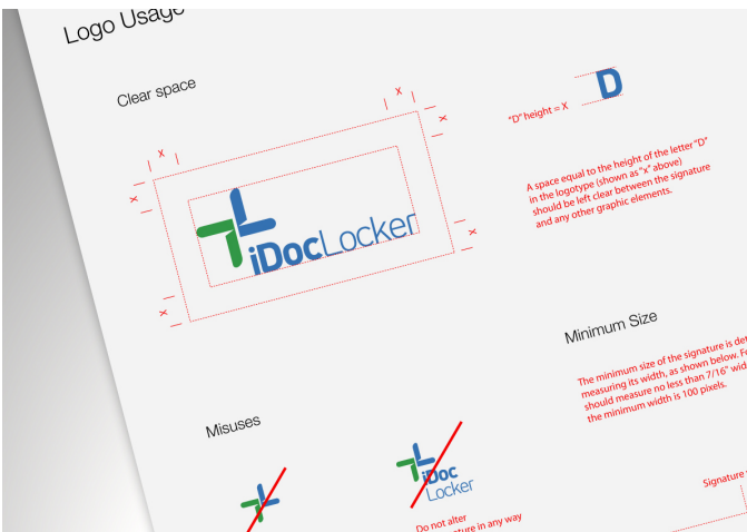
Visual Brand Guidelines